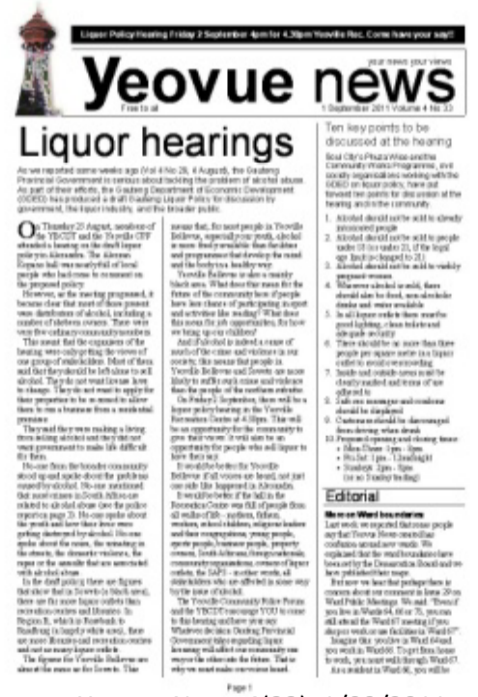
Yeovue News 4(33), 1/09/2011

Fighting Liquor Abuse "I get the government gazette every Friday by email. I look to see if there is anything for Yeoville. You have to monitor that stuff, to identify where the people are wanting to do something in the area, which you might not necessarily want. When did you last look in the classified of a newspaper? Nobody does. There is this theoretical ability for people to be able to have a say over what's happening in their community, but in fact it doesn't happen. We have opposed about 20 liquor licenses so far. And many times we have actually succeeded."